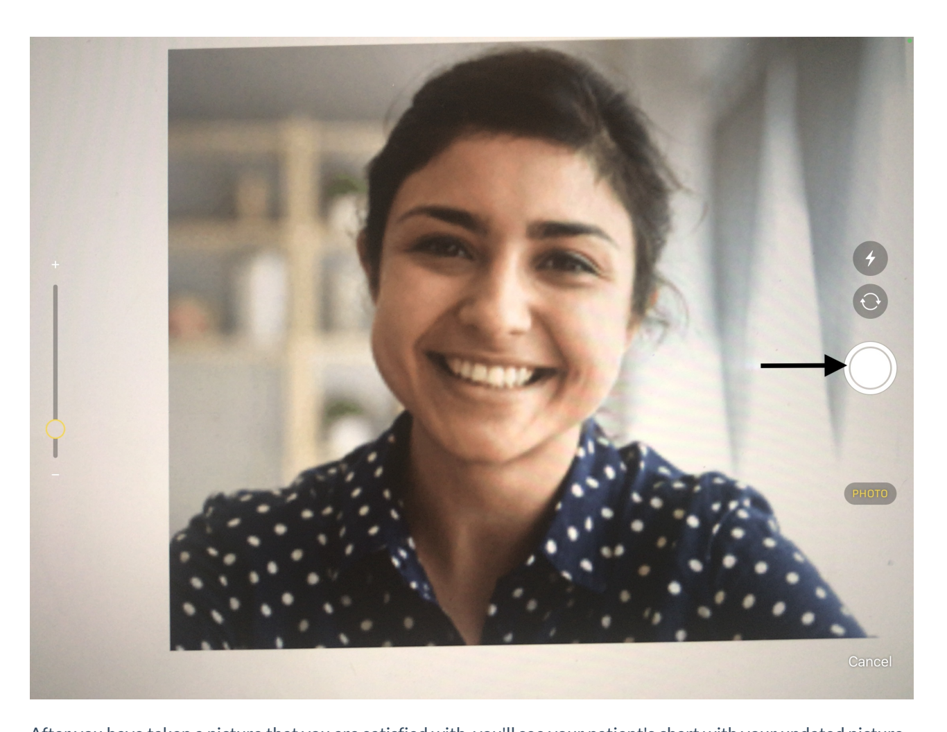
After you have taken a picture that you are satisfied with, you'll see your patient's chart with your updated picture.